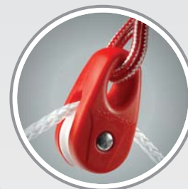
KITE BLOCK on Lashing