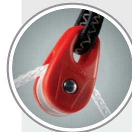
KITE BLOCK on 'Pigtail'