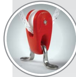
KITE BLOCK on Saddle