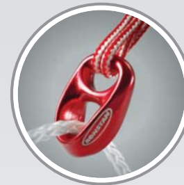
SHOCK on Lashing