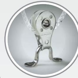
RF666 on Saddle