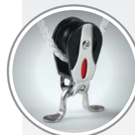
RF20101 on Saddle