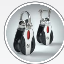
RF20101 with Shackle - 2 ways