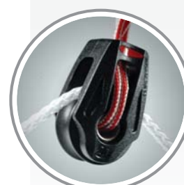
RF25109 on Lashing