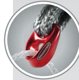
SHOCK on Dyneema® Link