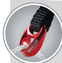
SHOCK on 8mm webbing