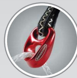
SHOCK on 'Pigtail'